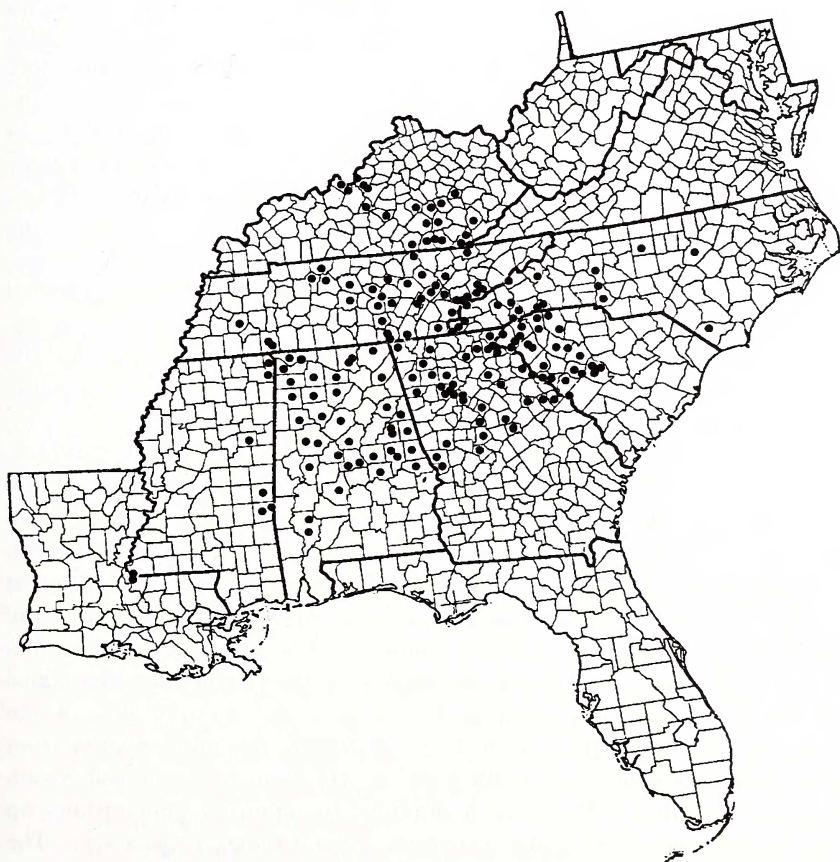
Fig. 2. Distribution of V. carolinianus .

The overall distribution, as documented herein, extends southward through the Cumberland Mountains from the Ohio River, the northern boundary in central Kentucky, and spreads eastward to the Appalachians